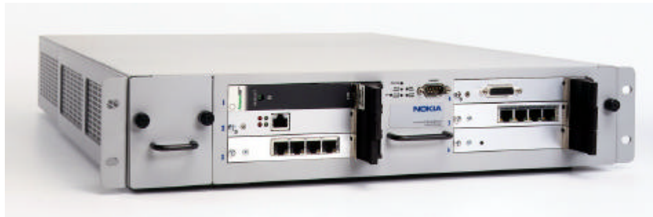
Figure 3. The Nokia LIC and LIB hardware

The architecture of the Nokia LIG hardware is based on two Nokia/IPRG IP650 units; one for the Lawful Interception Controller (LIC) and one for the Lawful Interception Browser (LIB) (1+1). The mechanical construction of the LIC and the LIB makes field maintenance and service user friendly. All interface cards are accessible at the front without opening the cover. The unit can be mounted to a 19" rack as well as it can be stacked.